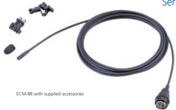
ECM-88 with supplied accessories

Whenever size, quality and reliability are of paramount importance, the Sony ECM-88 Series offers the perfect solution.